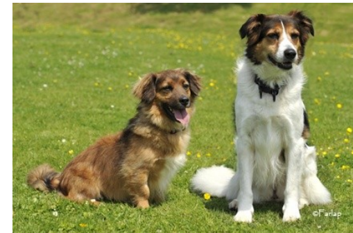
Pictured above: Bruno and Lady. They came into Gables Farm when their owner sadly passed away. We were able to place them in a loving new home

By becoming a Supporter of Gables Farm you will be helping to secure the future of unwanted and abandoned dogs and cats. It is only thanks to people like you that we are able to give these animals the second chance that they need.